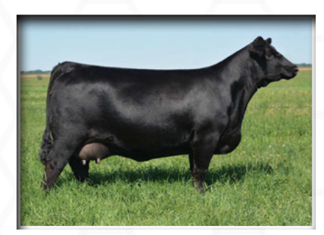
Bar-E-L Erica 74A Dam