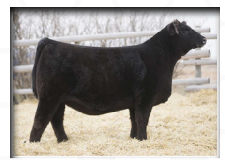
HLC Erica 561G Full Sister