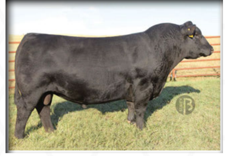
S A V International 2020 Sire