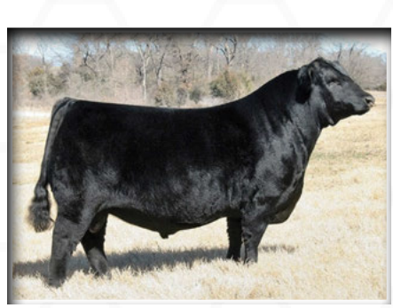
5T Power Chip 4790 Sire