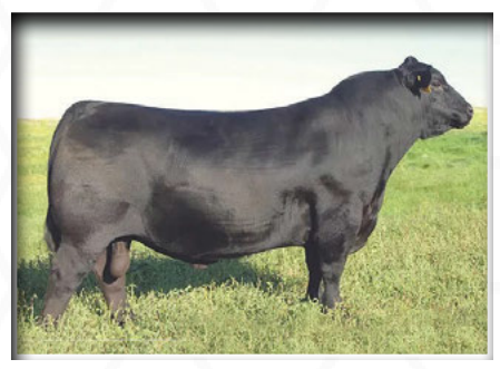
S A V Cutting Edge 4857 Sire