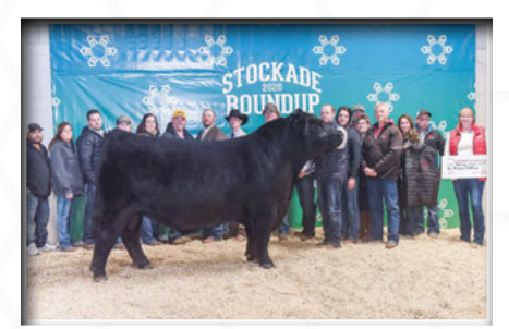
HLC GQ 278F Maternal Brother Supreme Champion Bull Lloyd Stockade Roundup 2020