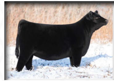
Piller Pretentious 2008H Full Sister