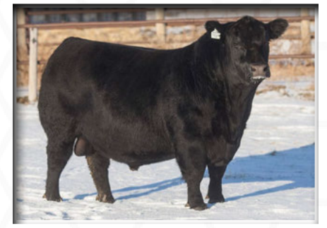
Brooking Firebrand 6068 Sire