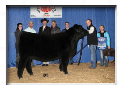
Plum Creek Pretentious 4011 Dam