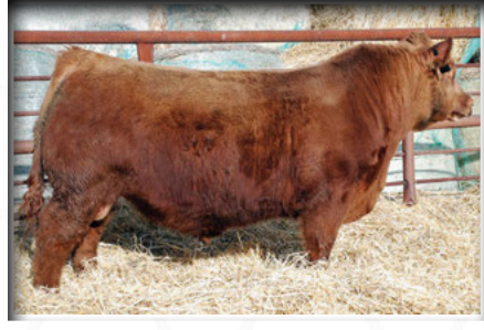
Red SSS Tactic 651D