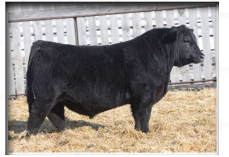
CHD 536G Paternal Brother Selected by Iron Saddle Ranch