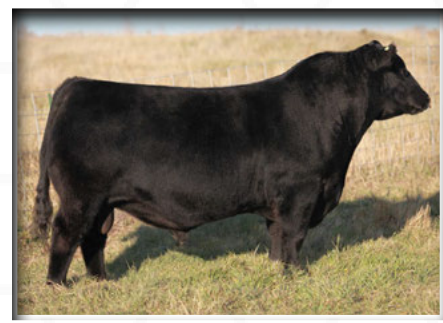
Brooking Silver Lining 5012 Sire