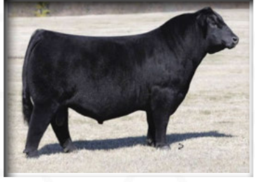
Conley Express 7211 Sire