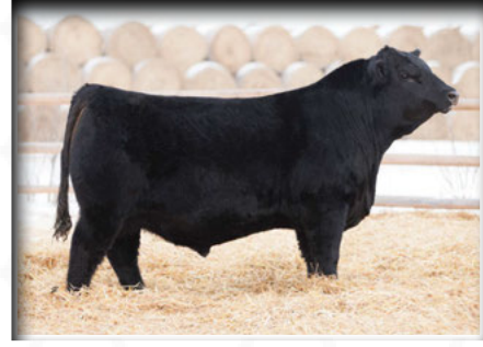
CHD 943E Paternal Brother Selected by Prime Time Cattle Co.