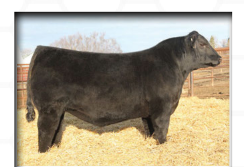
S A V National Anthem 5740 Sire