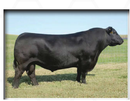
S A V Sensation 5615 Sire